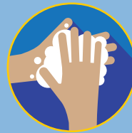
SCRUB: 20 SECONDS